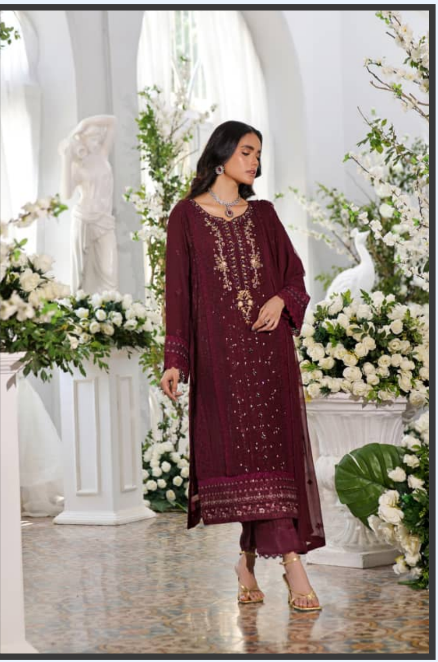
W W W GU N J T<sub>j</sub> S H I O N