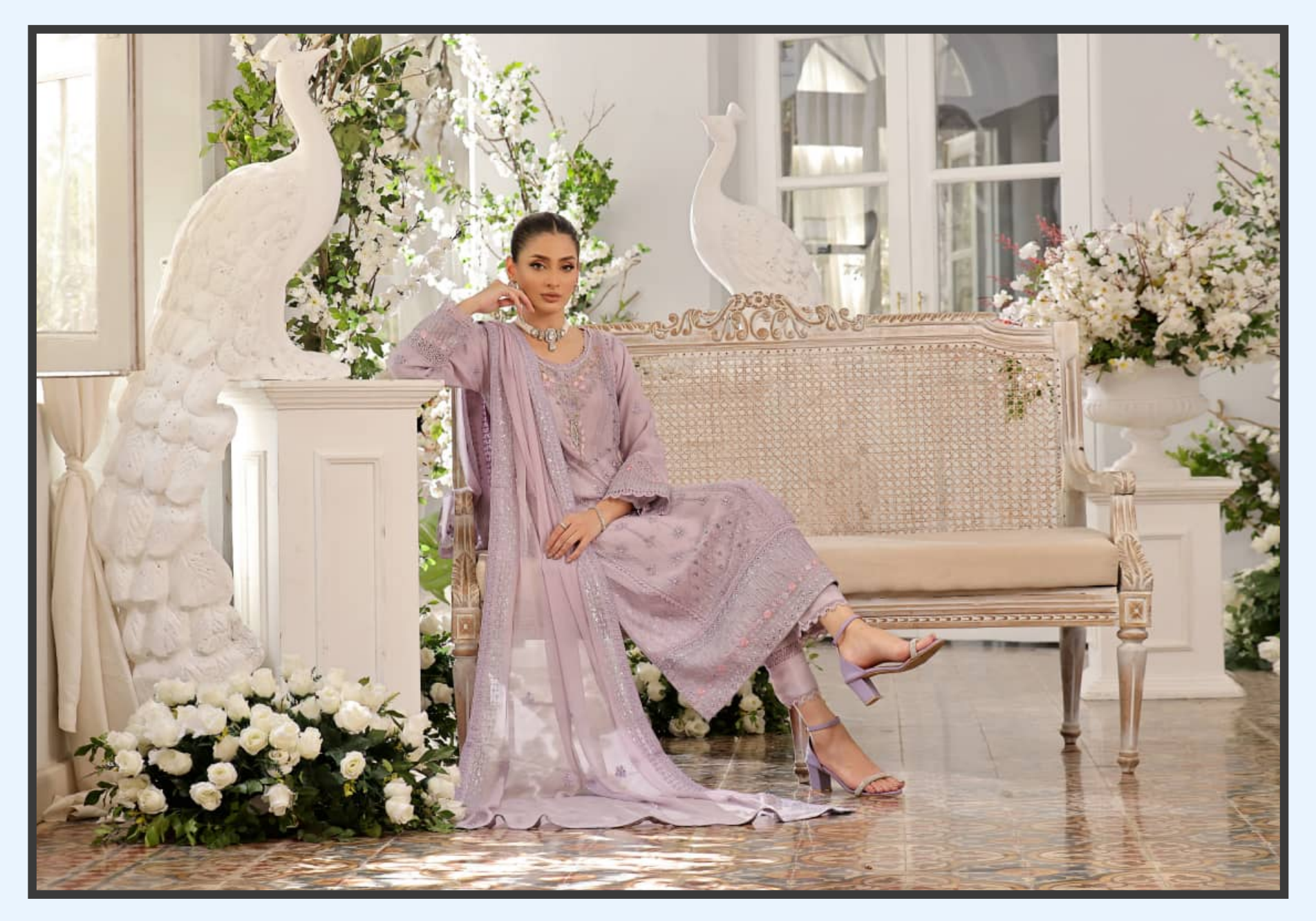
\mathbf{W} \ \mathbf{W} \ \mathbf{W} \ . \ \mathbf{G} \ \mathbf{U} \ \mathbf{Z} \ \mathbf{E} \ \mathbf{L} \ . \ \mathbf{F} \ \mathbf{A} \ \mathbf{S} \ \mathbf{H} \ \mathbf{I} \ \mathbf{O} \ \mathbf{N}