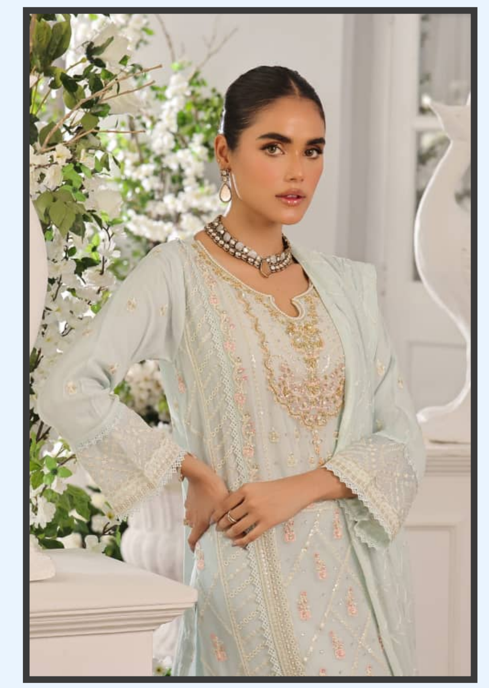
Ą V J FORM S TICHE IECE