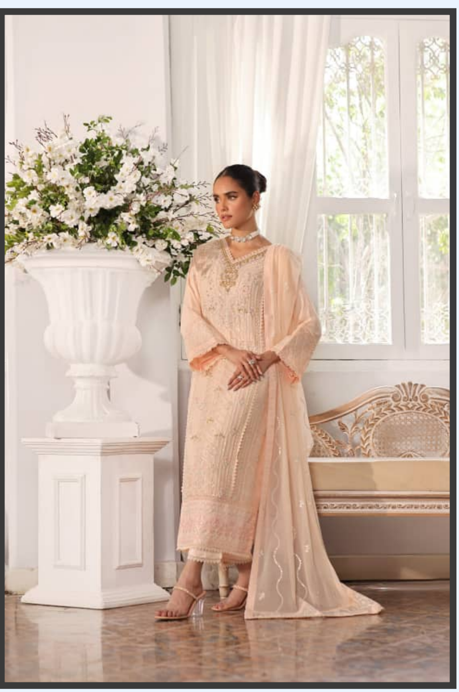
W W W 9 N Ţ H S \blacksquare NOI