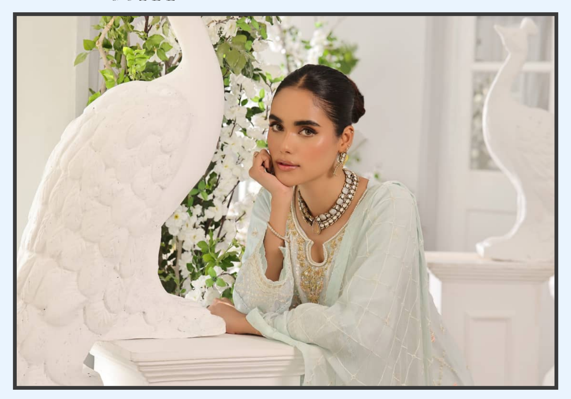
\mathbf{W} \ \mathbf{W} \ \mathbf{W} \ . \ \mathbf{G} \ \mathbf{U} \ \mathbf{Z} \ \mathbf{E} \ \mathbf{L} \ . \ \mathbf{F} \ \mathbf{A} \ \mathbf{S} \ \mathbf{H} \ \mathbf{I} \ \mathbf{O} \ \mathbf{N}