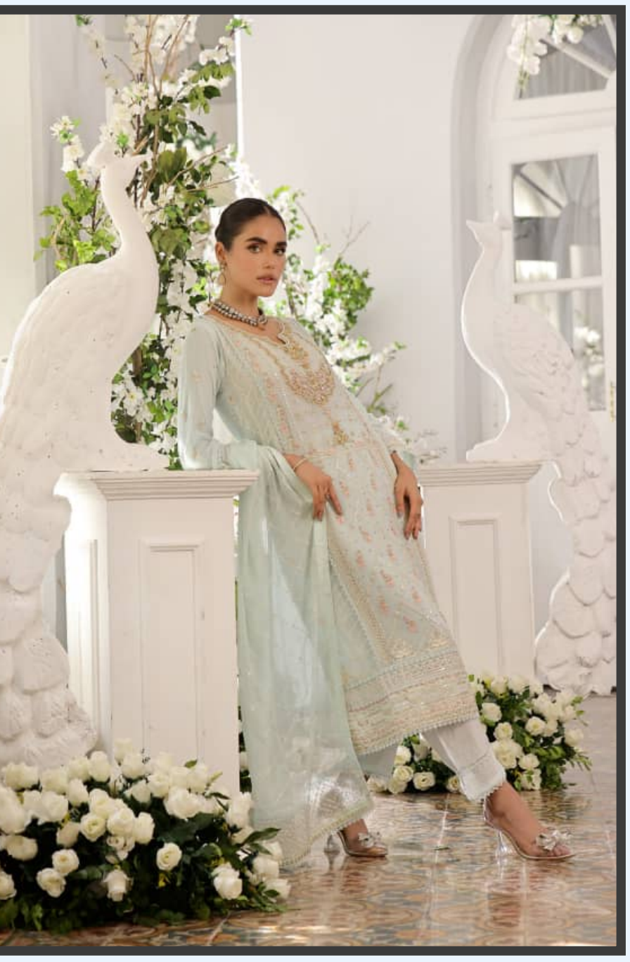
W W W N J B S NOI