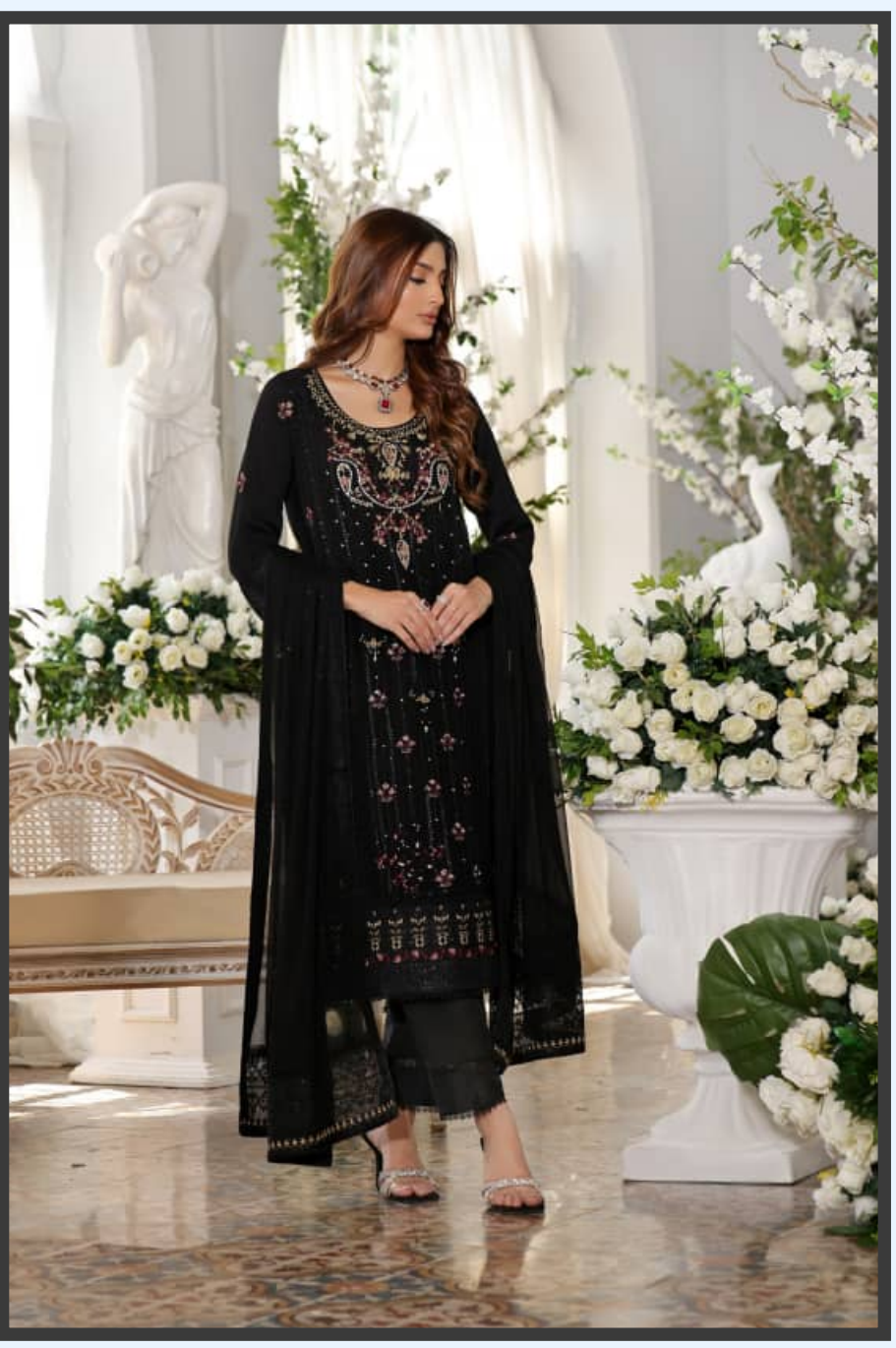
W W W N J 5 S NOI